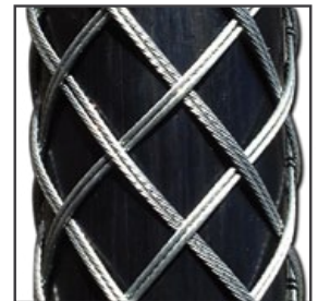
(2-layered / enhanced)

RP-700-H: Available in standard lengths 200 mm to 500 mm. Other lengths upon request! Also available in the following design: