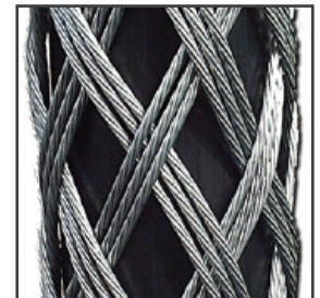
(3-layered / enhanced)

RP-100-3: Available in standard lengths 1300 mm (1000 mm braiding, 300 mm head). Other lengths upon request! Also available in the following design: