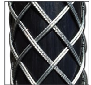
(2-layered / standard)